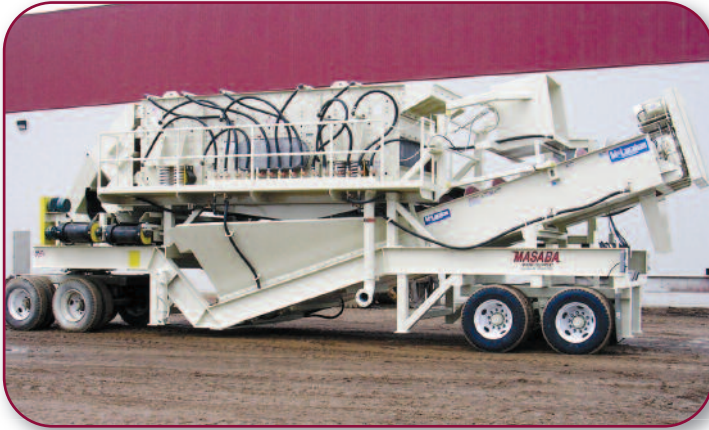
Portable Wash Plant with Cedarapids 6x20TD screen over McLanahan 36"x 25' twin screws