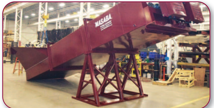
HEAVY DUTY stands for stationary applications