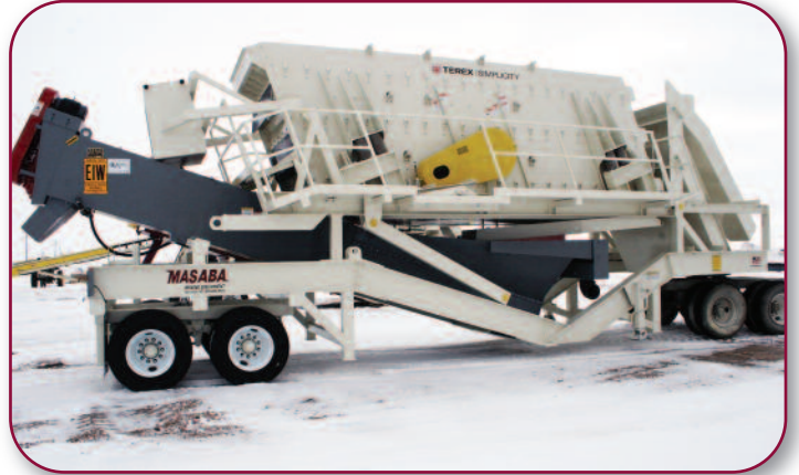
Portable Wash Plant with Simplicity 6x16TD incline screen over Eagle Single 36"x 25' screw