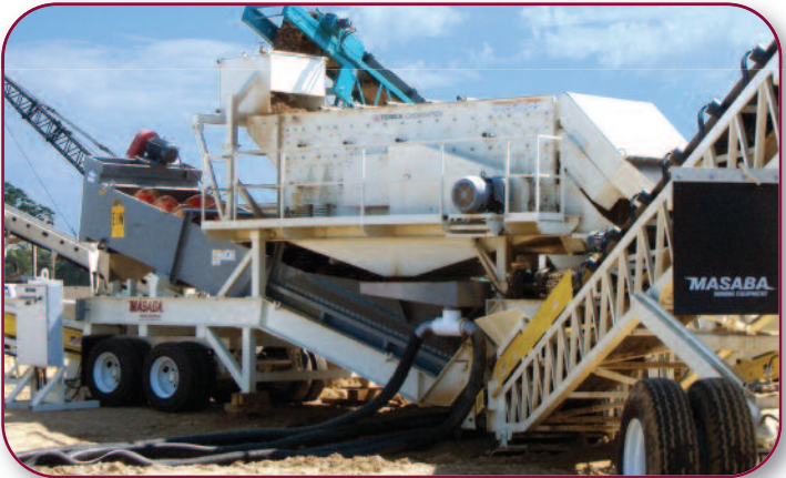
Portable Wash Plant with Cedarapids 6x16TD screen over Eagle Twin 36"x 25'