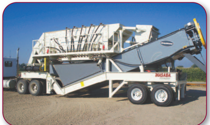
Portable Wash Plant with Cedarapids 6x16TD screen over Greystone 36"x 25' twin screws