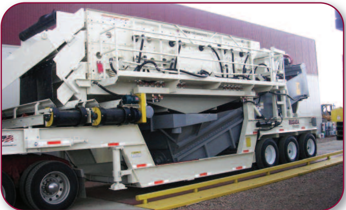
Portable Wash Plant with Cedarapids 6x20TD screen over Eagle twin 36"x 25'