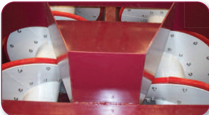
Premium Urethane Wear Shoes