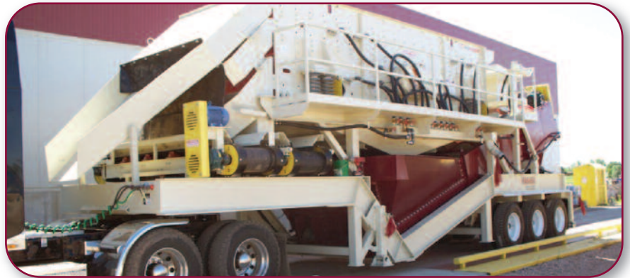
Portable Wash Plant with Metso 6x20TD screen over MASABA 36" x 25' twin screws

All high quality, standard off-the-shelf components make for high serviceability